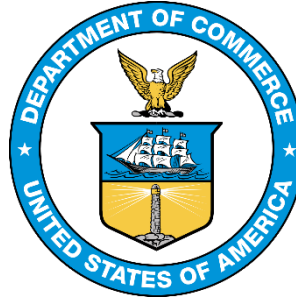
DEPARTMENT OF COMMERCE